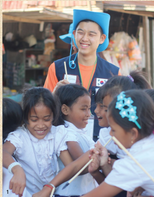
1 The beginning of precious relationship. With the Cambodia children at Holt Dream Center