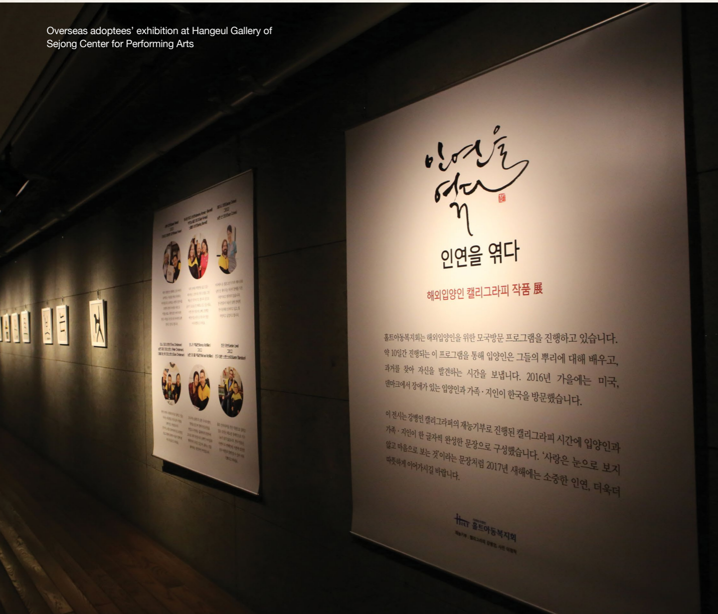
Overseas adoptees' exhibition at Hangeul Gallery of Sejong Center for Performing Arts