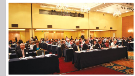
October 15, 2015 International seminar commemorating HCS's 60th anniversary