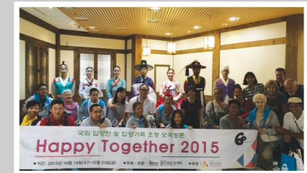
October 14-23, 2015 "Motherland Tour" commemorating HCS's 60th anniversary