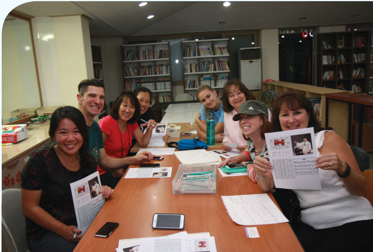
A Korean class at the center With volunteers and Holt family

I fell in love at Holt Ilsan... as cheesy as this title sounds... it is the truth!