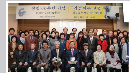
October 13, 2015 "Home Coming Day" commemorating HCS's 60th anniversary