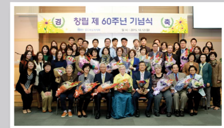
October 12, 2015 Thanksgiving service commemorating HCS's 60th anniversary

The world HCS dreams of is simple. It is a place where every child can have a dream in the warmth of a loving family and where everyone shares happiness with each other. HCS's 60th anniversary ended leaving us deeply moved and determined again to keep working for this dream.