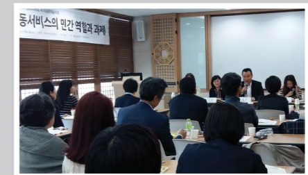
October 24, 2015 Domestic seminar commemorating HCS's 60th anniversary