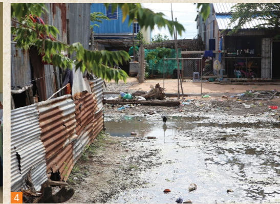
1 Children eating a meal prepared by Holt Dream Center 2 Painting after-school class 3 Children's various activities 4 The dire circumstances of Trapeang Anchanh