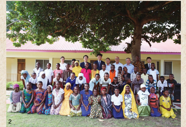
1 Opening ceremony of Tanzania Holt Dream Center 2 Together with children

hut. They had no kitchens so that they built a fire with the branches they picked at the yard in front of the hut and cooked ugali made of corn flour in boiling liquid. Yet the children still sing Hakuna Matata. And here we are who do not know how to appreciate all the things we have.