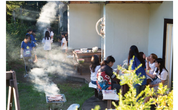
▲ Kumdongis are enjoying delicious barbecues.

"Hello everyone! It's the hottest day in 40 years. But I'm so happy we're here together in the cool lush woods of Pyeongchang." The cheerful opening of the host heralded the start of the exciting camp for the children who had been doing their best to fulfil their dreams for the past year. Kumdongis from all over the country gather once a year at the camp in the middle of summer vacation. This year's camp was particularly meaningful not only because it was the 10th anniversary but also because it took place in Pyeongchang where the Winter Olympics were held. Kumdongis fully enjoyed the summer for whole two days from August 16 to 17, beating the day's heat by splashing water and then enjoying the summer night with a program titled 'Dreaming Stars Shine.' Sean (rapper), the usual guest of the camp every year, came all the way to Pyeongchang to celebrate the 10th anniversary and made beautiful memories with Kumdongis.