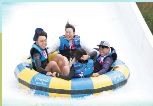
◀ Kumdongis are beating the day's heat splashing in cool water.

Dream & Hope program began in 2009 to support the education of children from families in crisis. The program has helped children in poor circumstances pursue their dreams. The children supported by the program are called 'kumdongi.' Kum means dream and dongi is a cute epithet for children in Korean. This year marks the program's tenth anniversary.