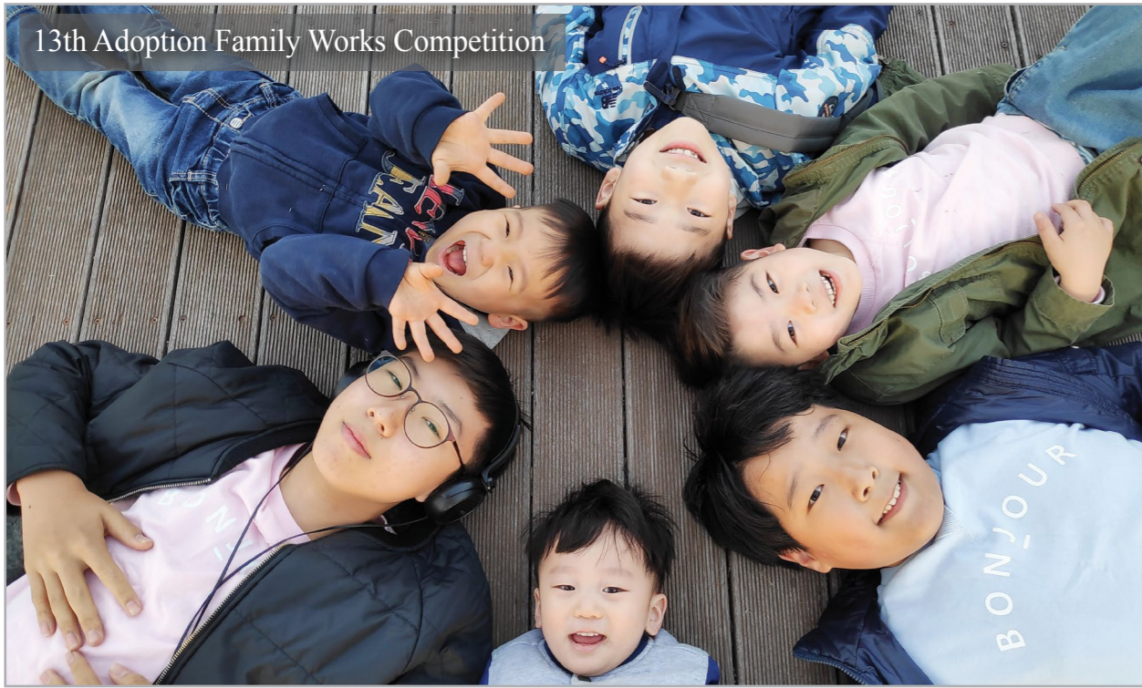
13th Adoption Family Works Competition

Overseas Residents and foreign residents in Korea who would like to donate to Holt Children's Services can be a Holt sponsor through the methods below.