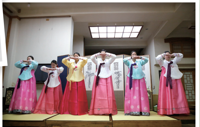
We are here to learn the motherland, Korea.

Shouting, kicking, and bowing in Hanbok, the adoptees found themselves in a new way. Seventeen grown-up adoptees for "Happy trail in Korea, 2013" had a great time to founding roots and building friendship and love. The motherland tour was held for two weeks from July 15 to July 27, 2013.