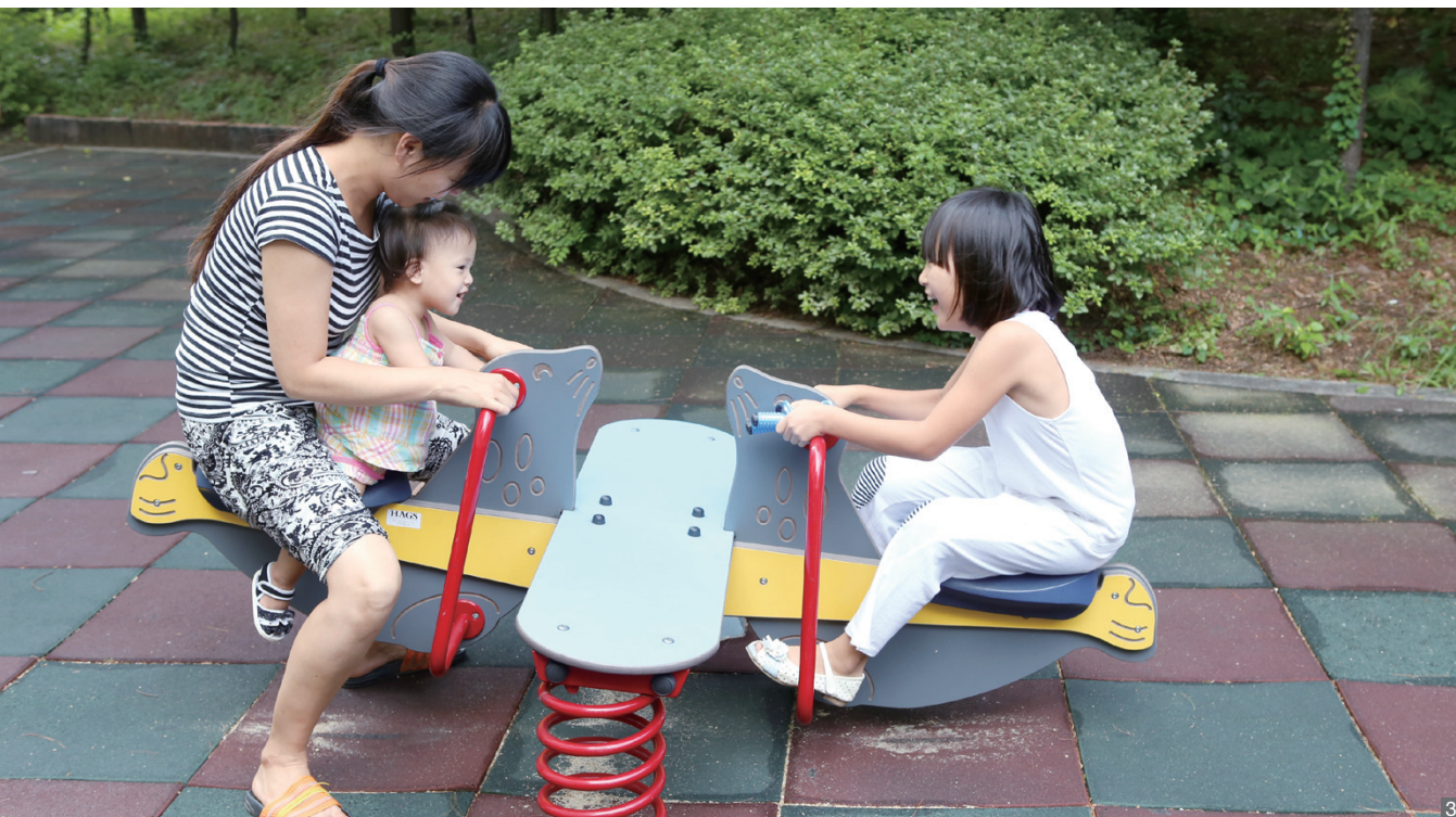
1 Tying up torn slippers with a rubber band. 2 Born weighing 600g, Hyeon grows up well. 3 In harmony with one another like a sea saw, the three are standing up to the world.