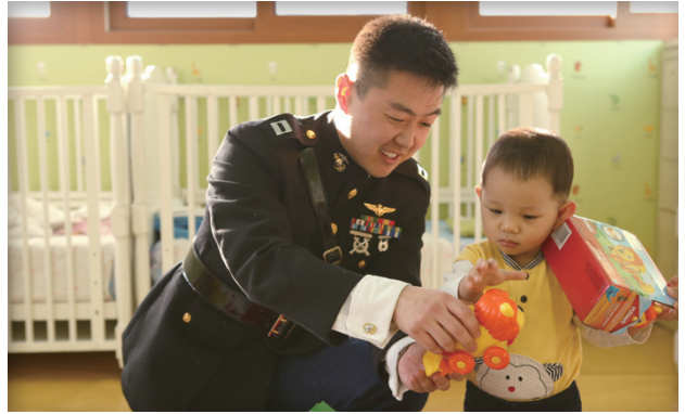
An adoptee came back as Santa Claus.