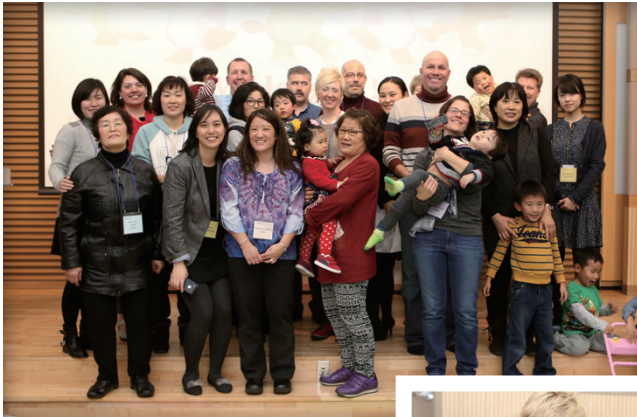
We came here to meet our children.