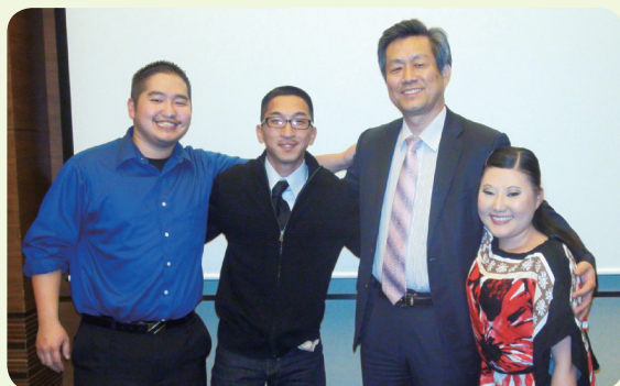
At the farewell banquet

In August of 2013, I received news that there would be a Korea motherland tour by Holt for adoptees with disabilities. Before this, Korea seemed like a far away land to me. A land I may never see and really didn't have a desire to see. My life was built in America. My family was in America, but this was an opportunity of a lifetime. A chance to say thank you to my birth parents for give me the opportunity to live.