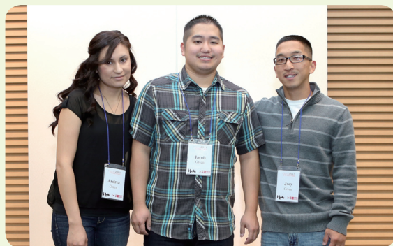
During the welcoming ceremony

To live a life full of love and embrace who God created me to be. I went believing God wanted to show me my past, but his plans were greater. The week I spent in Korea was eye opening.