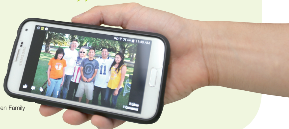
The Green Family