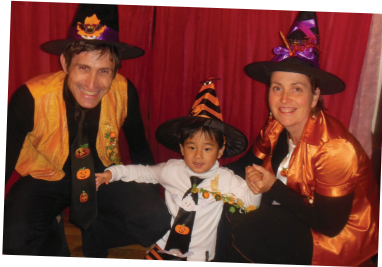
Love is magic~