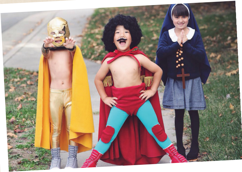
Um hahaha~ candy!