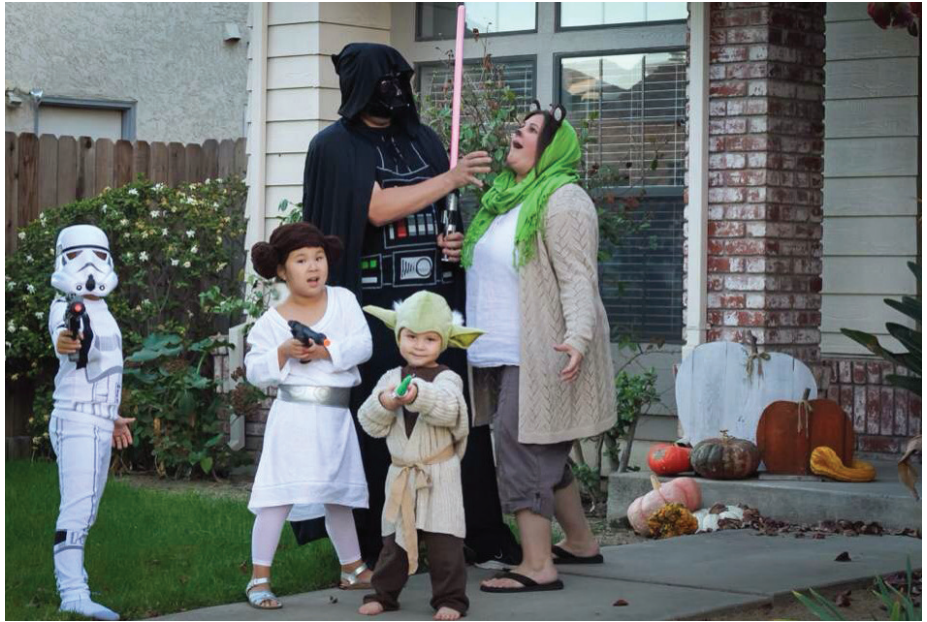
wow! starwars family

They received three handbooks for next year's Halloween.