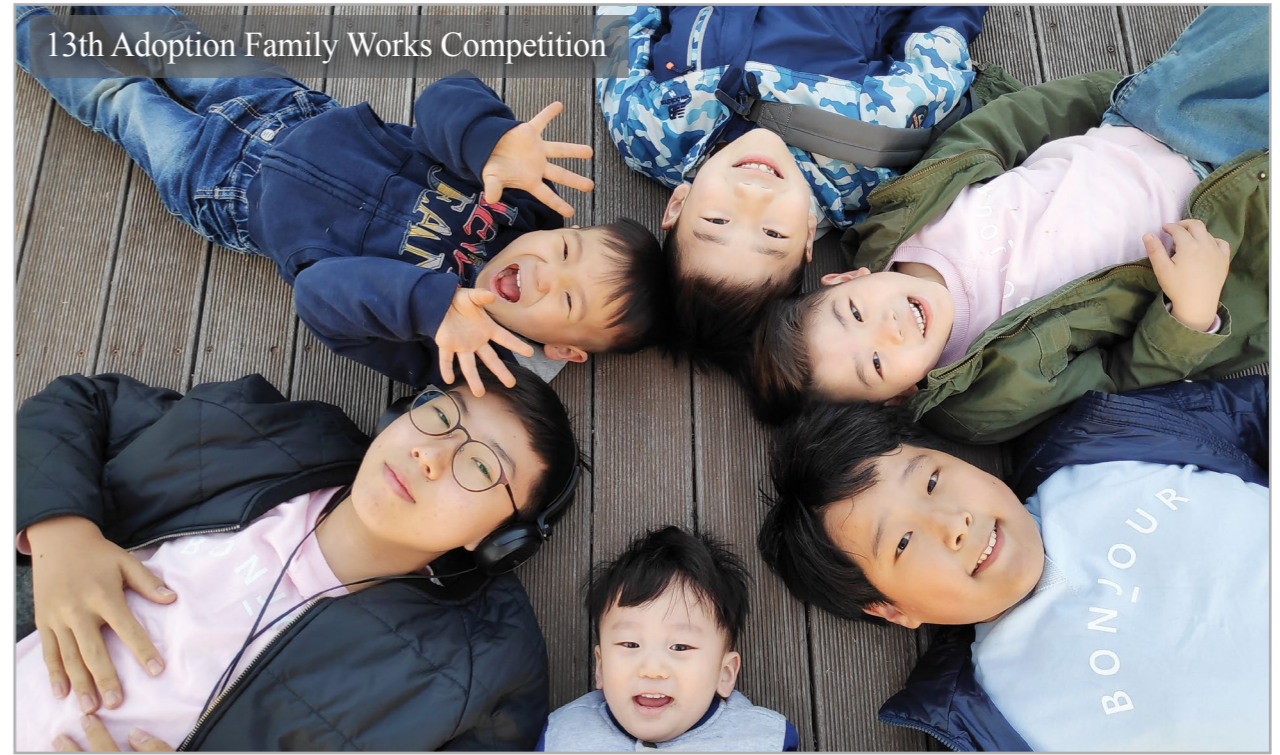
13th Adoption Family Works Competition

Overseas Residents and foreign residents in Korea who would like to donate to Holt Children's Services can be a Holt sponsor through the methods below.