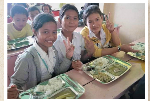
▲ When she was in Holt Dream Center

Q. What are the memorable moments while you work as a staff at the center?